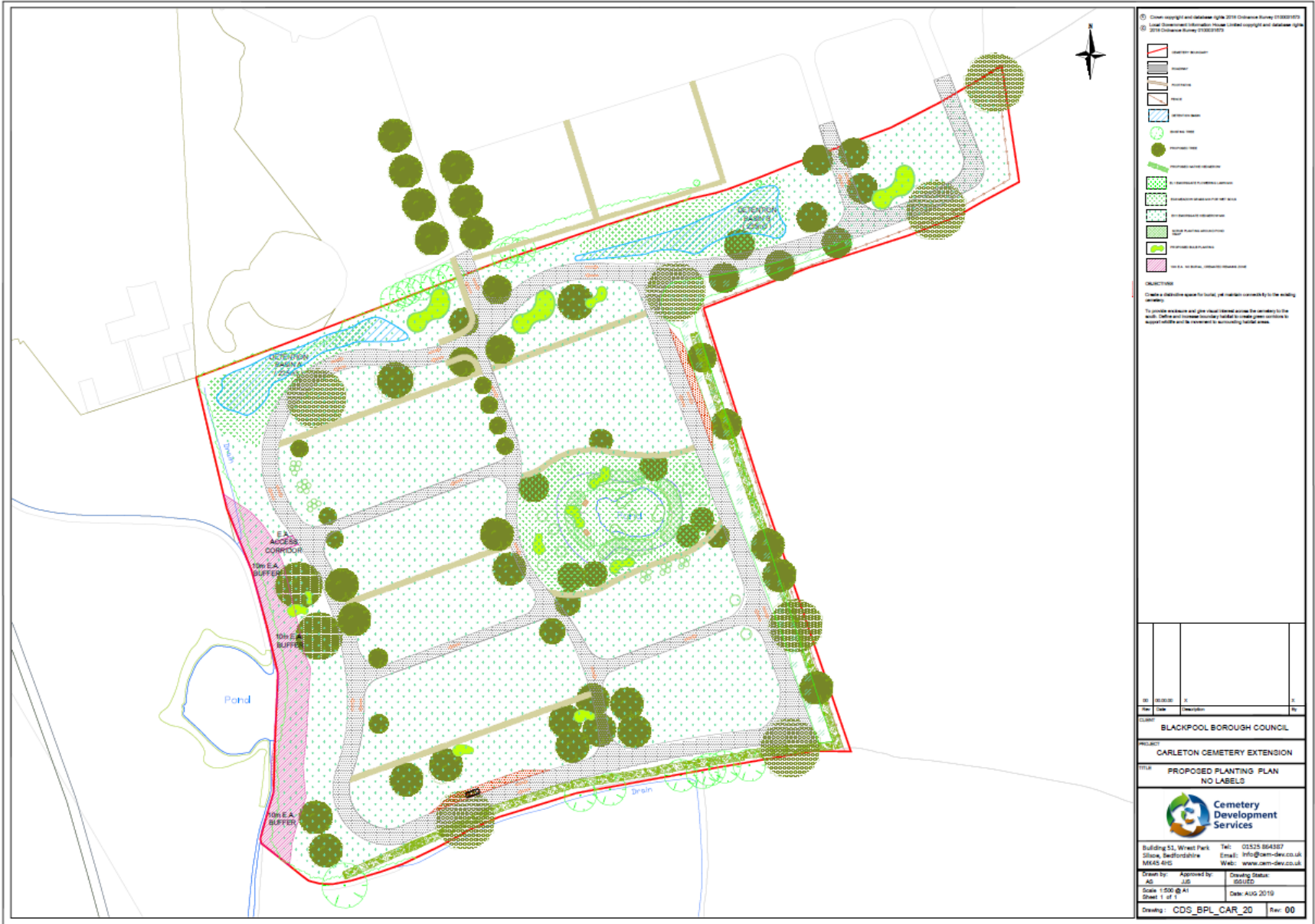
Landscaping and drainage plan